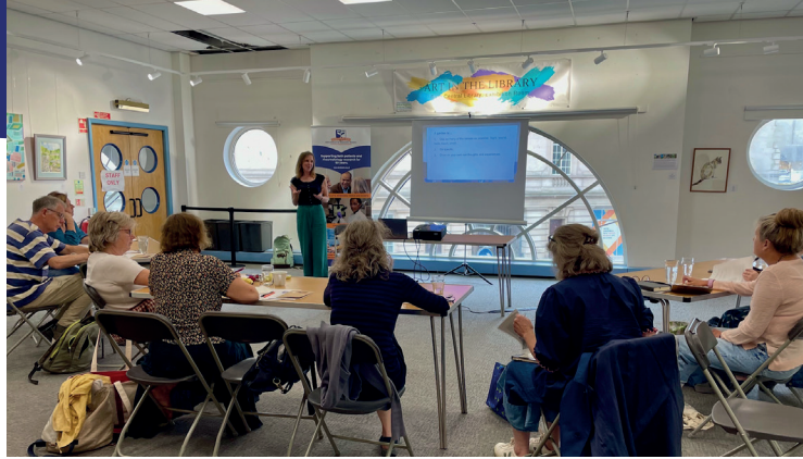
Creative Writing workshop: coping with a rheumatic condition

I just wanted to write and say how much I appreciate the BIRD podcasts. I have systemic sclerosis and I find these podcasts informative and reassuring. They enable me to find a trusted source on the condition and provide me with very helpful information about health management